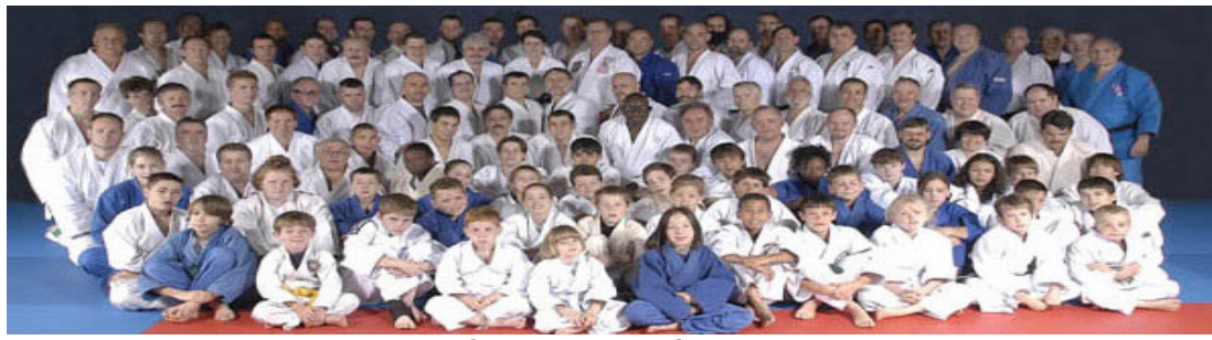
Some of our 300+ previous campers

Improve Your Judo, Japanese JJ & Brazilian JJ Skills June 20-22, 2024