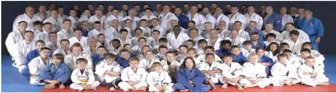
Some of our 300+ campers from 2009